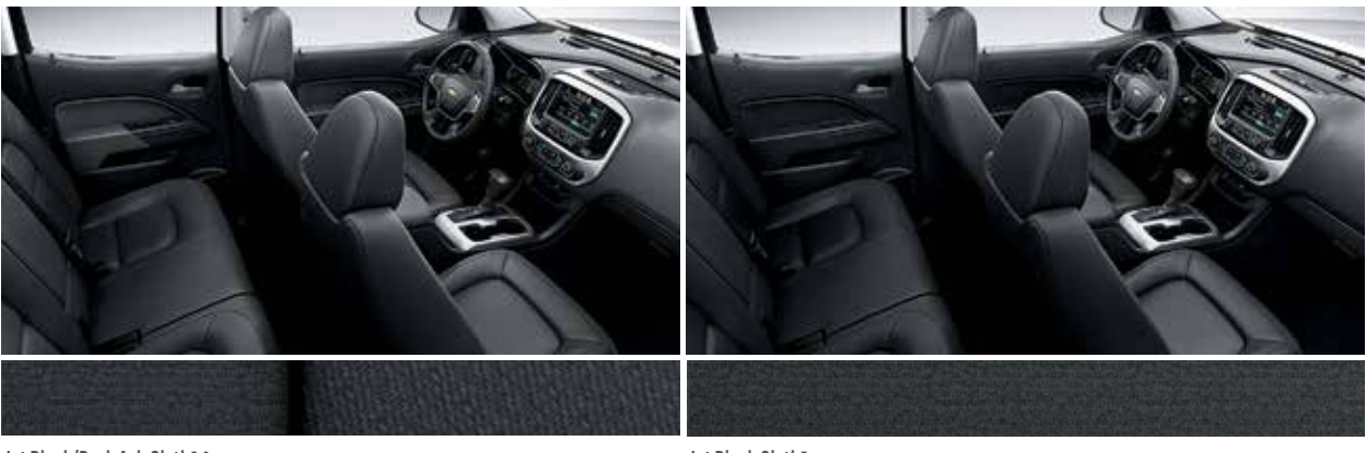
Jet Black/Dark Ash Cloth 5, 6