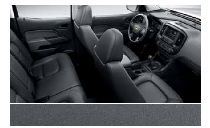
Jet Black/Dark Ash Vinyl<sup>4</sup>