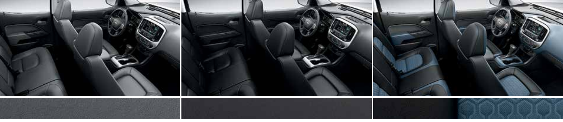
Jet Black/Dark Ash Leather Appointments<sup>8</sup>