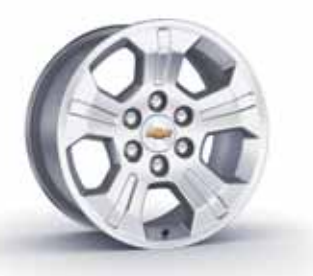
18" BRIGHT MACHINED (RD1) STANDARD ON LTZ Z71, AVAILABLE ON LT Z71