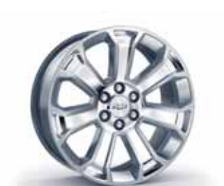
22" 7-SPOKE SILVER (RX1) ACCESSORY WHEEL<sup>3</sup>