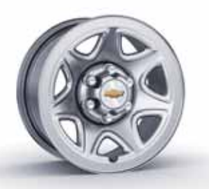
17" PAINTED STEEL (RD6) STANDARD ON WT