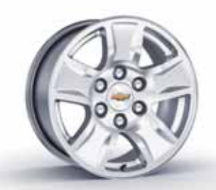
17" ALUMINUM (Q5U) STANDARD ON LT AND LT Z71