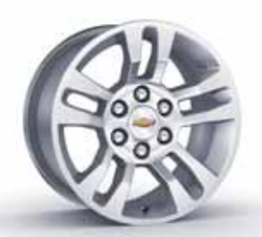
18" BRIGHT MACHINED (PZX) STANDARD ON LTZ, AVAILABLE ON LT