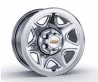
17" STAINLESS STEEL-CLAD (RD7) STANDARD ON LS