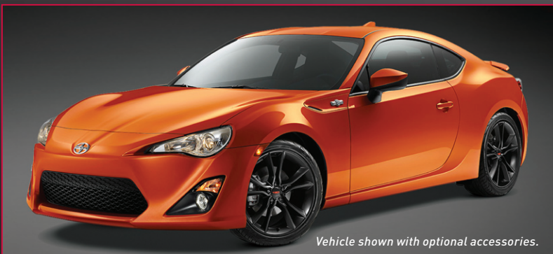
Vehicle shown with optional accessories.