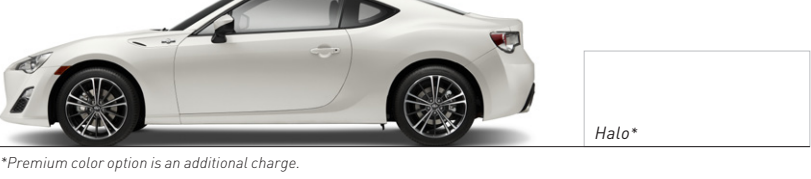
*Premium color option is an additional charge.