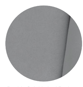
Double Cab Limited Package with SofTex® in Graphite