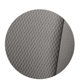
Double Cab SR5 fabric in Graphite