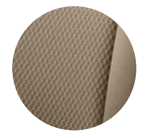
Double Cab SR5 fabric in Sand Beige