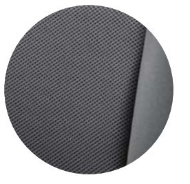
Access Cab with PreRunner Sport fabric in Graphite