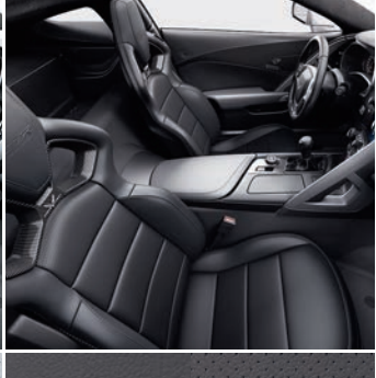
Dark Gray Leather with Available Competition Sport Seats (3LZ)