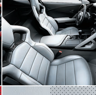
Gray Leather/Sueded Microfiber Inserts with Available Competition Sport Seats<sup>1</sup> (3LT)