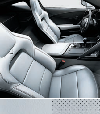
Gray Leather (2LT)