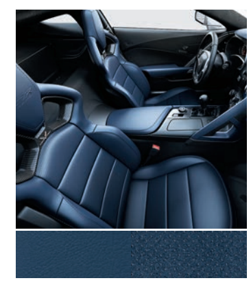
Twilight Blue Design Package: Leather with Available Competition Sport Seats