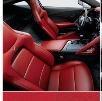
Adrenaline Red Leather (3LT)