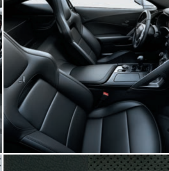
Jet Black Leather (2LT)