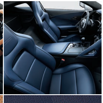
Blue Leather (3LZ)