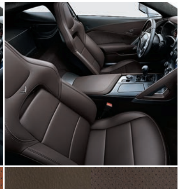
Brownstone Leather (3LT)