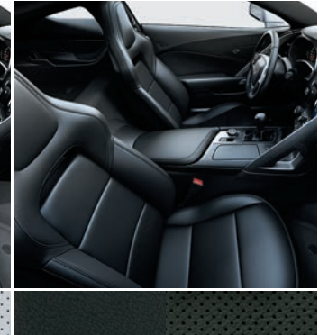
Jet Black Leather (1LT)