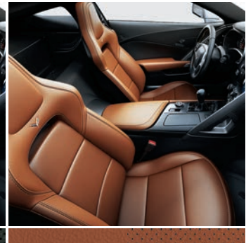
Kalahari Leather (2LT)