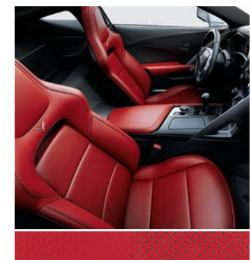
Adrenaline Red Leather (2LT)