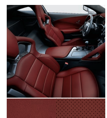
Spice Red Design Package: Leather with Available Competition Sport Seats