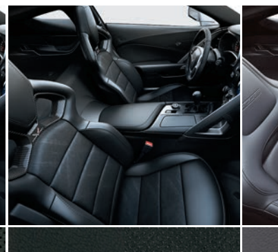
Black Leather/Sueded Microfiber Inserts with Dark Gray Leather (1LZ) Available Competition Sport Seats<sup>1</sup> (1LT)