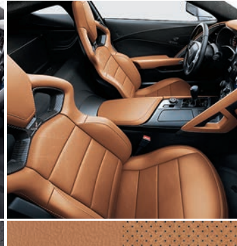
Kalahari Leather/Sueded Microfiber Inserts with Available Competition Sport Seats1 (3LT)