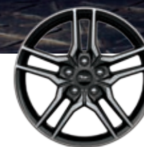
18" x 8" Machined-Face Aluminum with High-Gloss Ebony Black-Painted Pockets [Available]