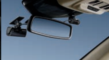
Dash cam systems ‡

New Vehicle Limited Warranty. We want your Ford Mustang® ownership experience to be the best it can be. Under this warranty, your new vehicle comes with 3-year/36,000-mile bumper-to-bumper coverage, 5-year/60,000-mile Powertrain Warranty coverage, 5-year/60,000-mile safety restraint coverage, and 5-year/unlimited-mile corrosion perforation (aluminum panels do not require perforation) coverage – all with no deductible. Please ask your Ford Dealer for a copy of this limited warranty.