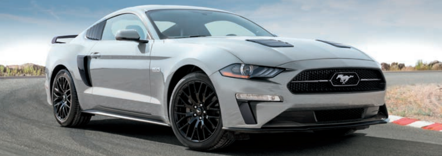
GT Premium in Iconic Silver Metallic accessorized with available Performance Package, rear spoiler, side and quarter window scoops, ‡ hood vents, ‡ park lamp curtains, ‡ Pony grille insert, wheel center caps, and wheel lock kit