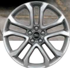
20" x 9" Premium Painted Aluminum¹ [Optional]