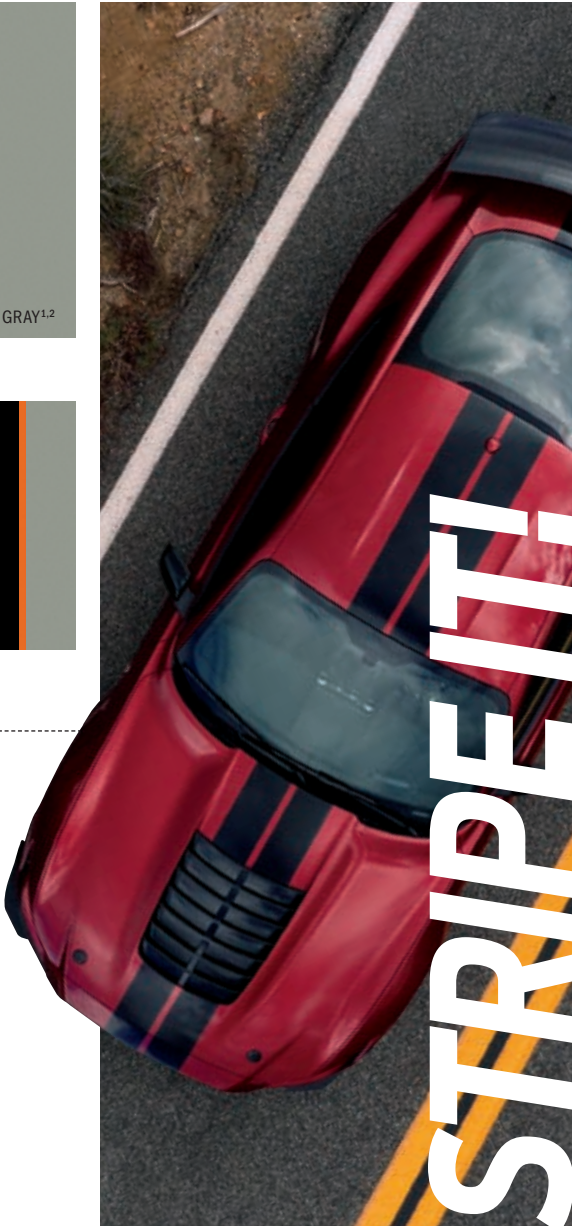
Shelby GT500 over-the-top racing stripes available in vinyl or painted. 3 Optional vinyl side stripes offered in same color scheme as vinyl over-the-top racing stripes.