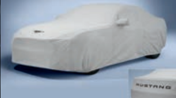
Full vehicle covers ‡