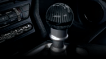
Carbon fiber gear shift knob