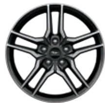
18" x 8" Machined-Face Aluminum with High-Gloss Ebony Black-Painted Pockets 4 [Standard]