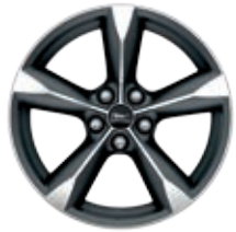
18" x 8" Machined-Face Aluminum with Low-Gloss Ebony Black-Painted Pockets 4 [Optional]