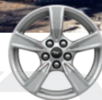
17" Sparkle Silver-Painted Aluminum [Standard]