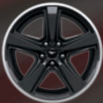
19" x 9.5" front 19" x 10.0" rear Tarnish Dark-Painted Low-Gloss Aluminum [Standard]