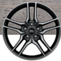
18" x 8" Machined-Face Aluminum with High-Gloss Ebony Black-Painted Pockets¹ [Standard]