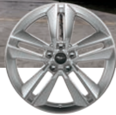
19" x 8.5" Polished Aluminum¹ [Optional]