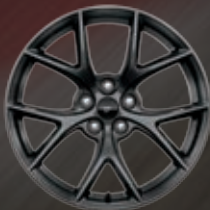
19" x 9.5" front 19" x 10.0" rear Magnetic-Painted Aluminum [Optional]