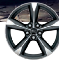
18" x 8" Machined-Face Aluminum with Low-Gloss Ebony Black-Painted Pockets [Optional]